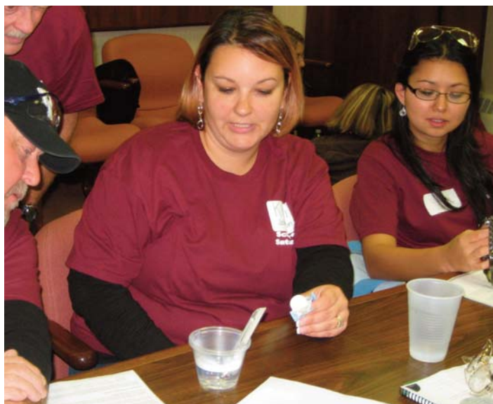
Kentucky educators participate in CEF's You Be The Chemist Professional Development: Making Chemistry Matter workshop. The program was organized by CEF and Arch Chemicals, Inc. at their Brandenburg, KY site.